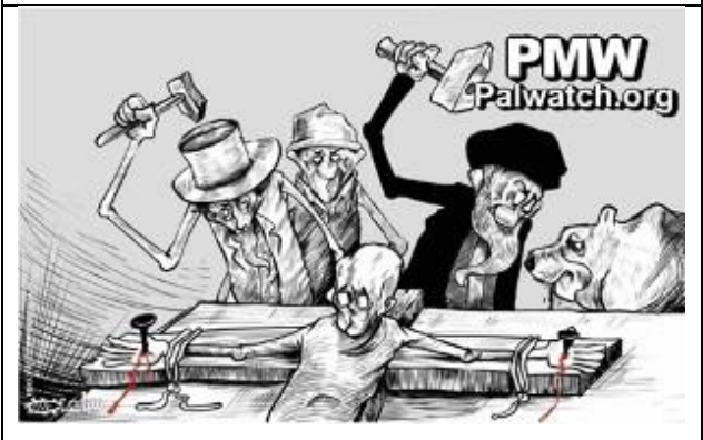
Official PA newspaper publishes cartoon showing Jews crucifying Palestinian boy, while Israeli soldier watches and does nothing. ( Al-Hayat Al-Jadida , Dec. 2, 2015).<sup>69</sup>

Official PA newspaper publishes cartoon depicting Israel controlling the United States which controls the world. ( Al-Hayat Al-Jadida , Oct. 4, 2016).<sup>68</sup>