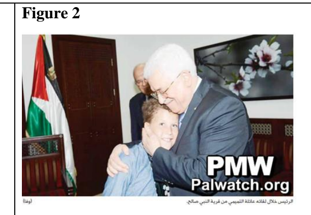
Abbas embraces child rock-thrower (September 2015)

Below are some additional examples of PA educators inciting children to hatred and violence: