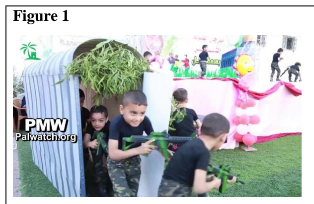
Young boys dressed as Hamas fighters exiting a tunnel at Gaza child festival

General community activities also promote violence and martyrdom to children. A YouTube video from a 2016 Islamic Association child festival in Gaza displayed images of young boys dressed as Hamas fighters exiting a Hamas tunnel with rifles, dancing with their rifles, and capturing Israeli soldiers. A girl narrates, encouraging children to die as martyrs: "Forward, my child, to the duel. You will die as a Martyr (Shahid) and blow up the enemies." 108