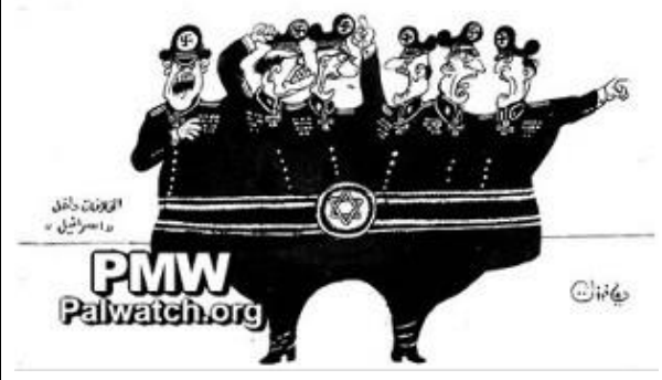
Cartoon published on Fatah website depicts Israelis as Nazis ( Website of Fatah Information and Culture Commission , Nov.11, 2015).<sup>70</sup>